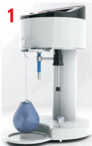
Weighting float on air...