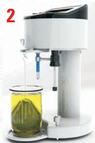
Weighting float in liquid...